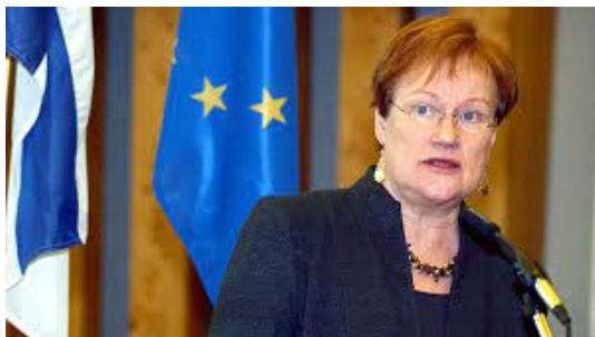
President Tarja Halonen Former President Finland

Speaker announcement: We are excited to announce two new speakers to the program. Check out the full program at : http://climateactionday.net .